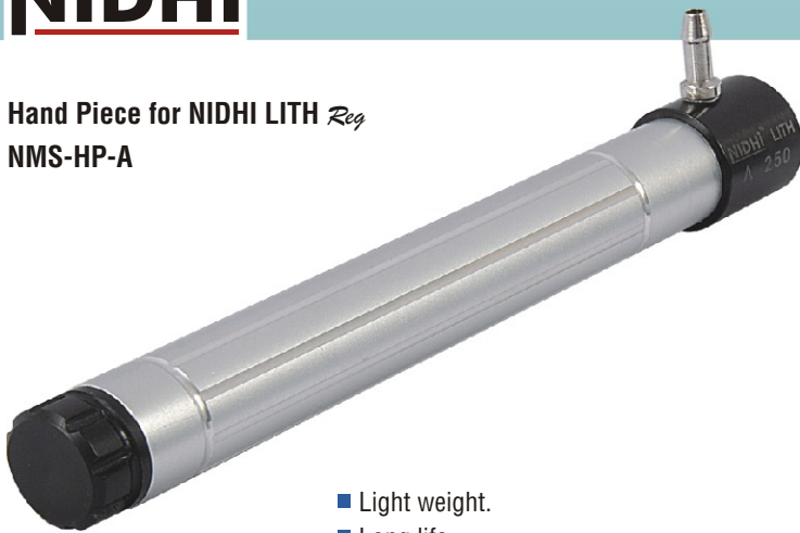
Hand Piece for NIDHI LITH Reg NMS-HP-A