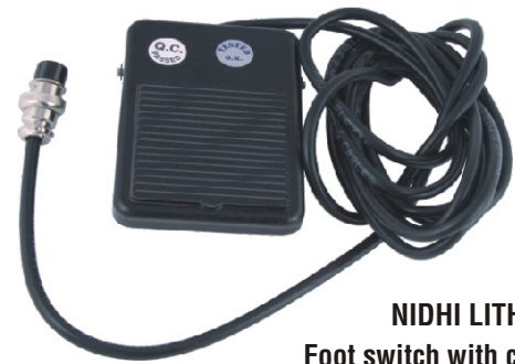
NIDHI LITH Reg Foot switch with cable