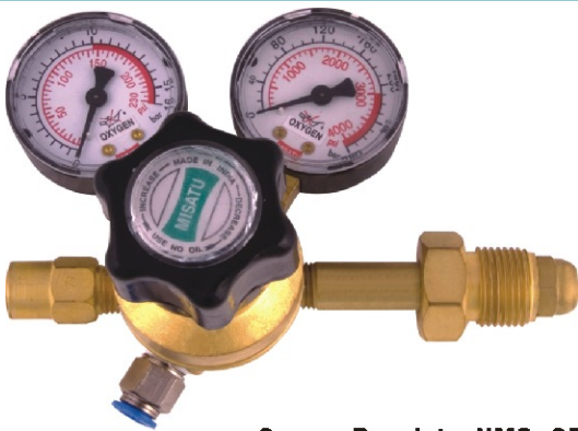
Oxygen Regulator NMS -OR

SOURCE OF COMPRESSED AIR : This electro pneumatic device requires the supply of continuous, quiet, clean and dry air pressure. The air source can be procured by three ways like Air compressor, Central Oxygen System, Oxygen Cylinder.