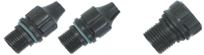
Hand Piece Top