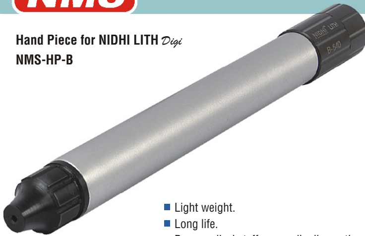
Hand Piece for NIDHI LITH Digi NMS-HP-B