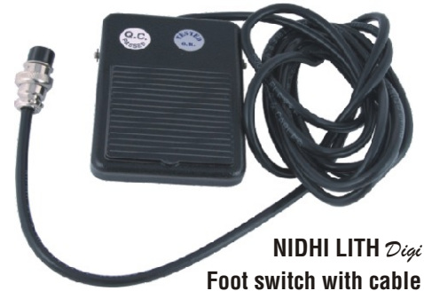
NIDHI LITH Digi Foot switch with cable